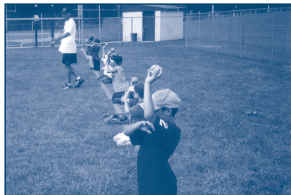
Practicing throwing fundamentals

Each complex is equipped with batting cages and multiple well maintained fields which allows our staff full supervision of campers at all times.