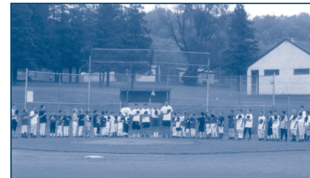
Opening ceremonis at our Horsham Camp